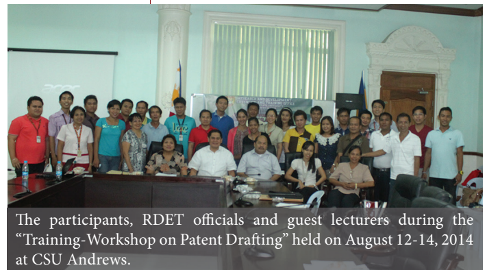
The participants, RDET officials and guest lecturers during the "Training-Workshop on Patent Drafting" held on August 12-14, 2014 at CSU Andrews.

Evidently, the seminar series had produced a growing number of submitted creative and innovative outputs from CSU faculty-researchers for copyright and patent applications. ■