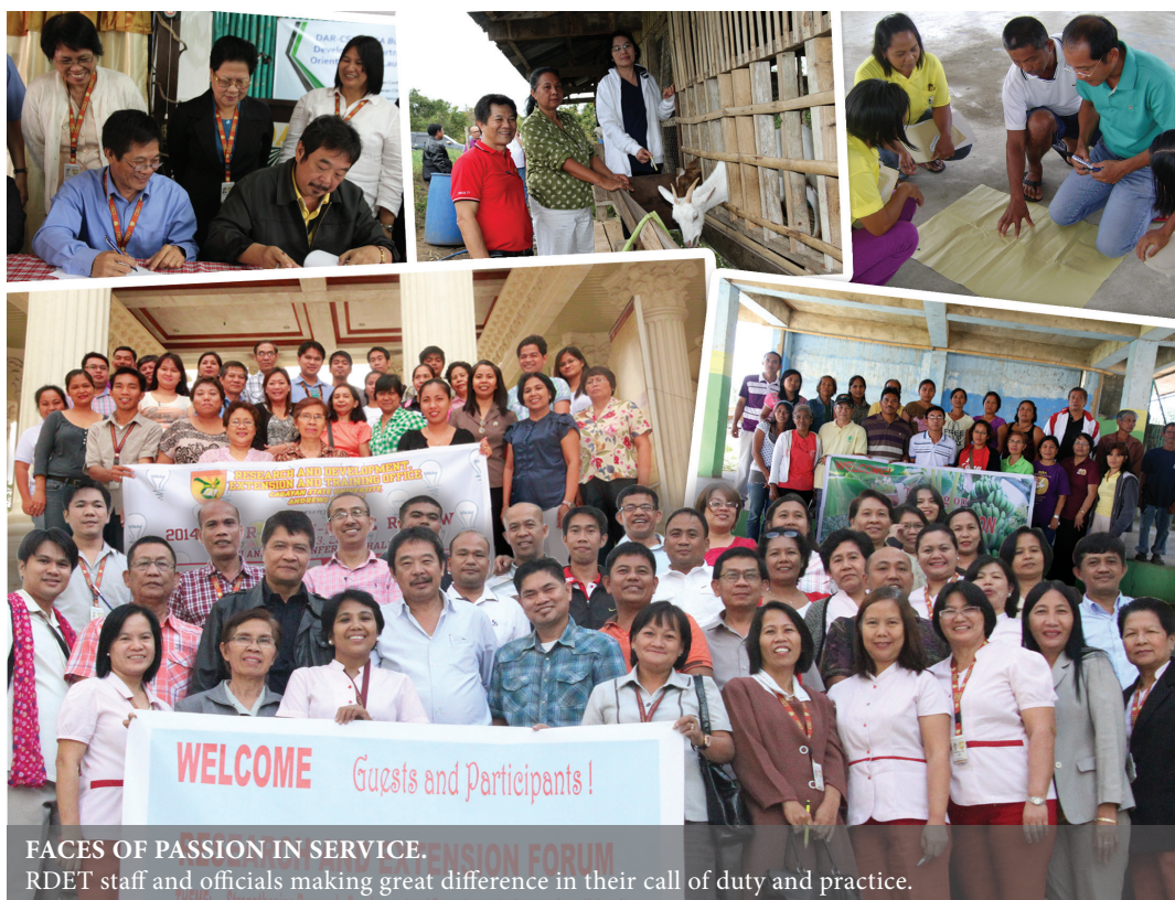
FACES OF PASSION IN SERVICE. RDET staff and officials making great difference in their call of duty and practice.